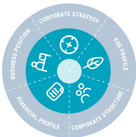
Figure 1 - The five pillars of Robeco's fundamental credit analysis

For information purposes only and not intended as investment advice.